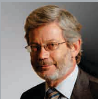
Juan Andrés Fontaine Talavera DIRECTOR

Director of Companies B.Sc. Management and Science, London School of Economics, England