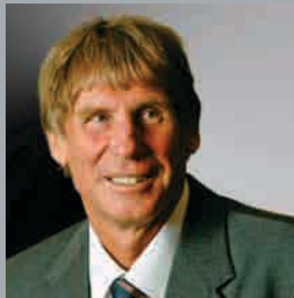
Hernán Büchi Buc DIRECTOR

Civil Mining Engineer, Universidad de Chile