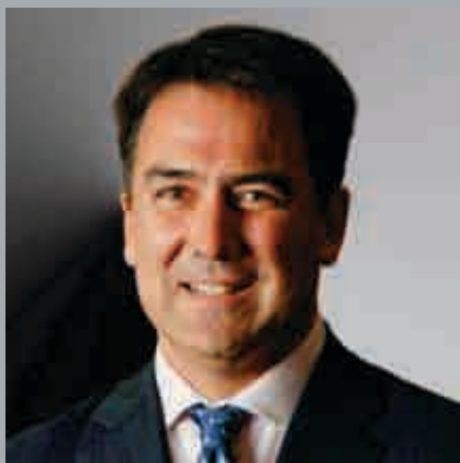
Jean - Paul Luksic Fontbona DIRECTOR

Director of Companies B.Sc. Management and Science, London School of Economics, England