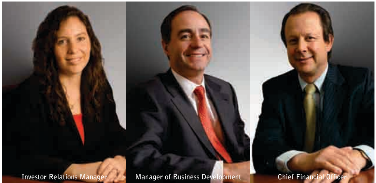
Investor Relations Manager